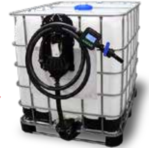
DURA-PUMP EASY CADDY

The dura lliw amua pump up to 55 liters per minute.