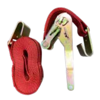
2" Ratchet Straps