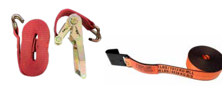
2" Ratchet Straps w/ J Hook