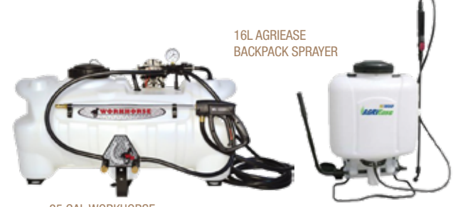
25 GAL WORKHORSE ATV SPRAYER