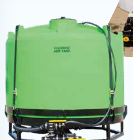
CHEMBINE HOT TANK 1680 US GAL HWF100610